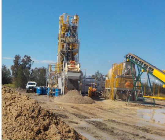
Fig 1. Pilot operations

Additional piloting undertaken by Astron includes Mineral Separation Plant concepts using conventional gravity, magnetic and electrostatic separation techniques. Astron will report on these results separately.