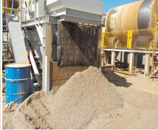
Fig 2. Sand fraction oversize +3mm